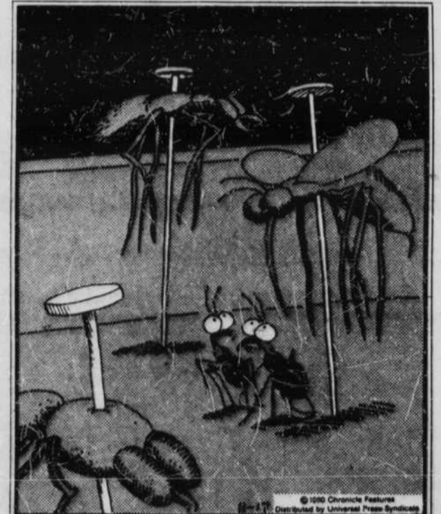
ead, I hate walking through this place at night.