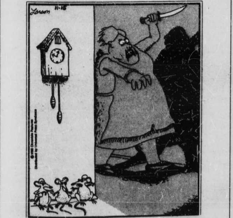
"Egad! ... Sounds like the farmer's wife has really flipped out this time!"