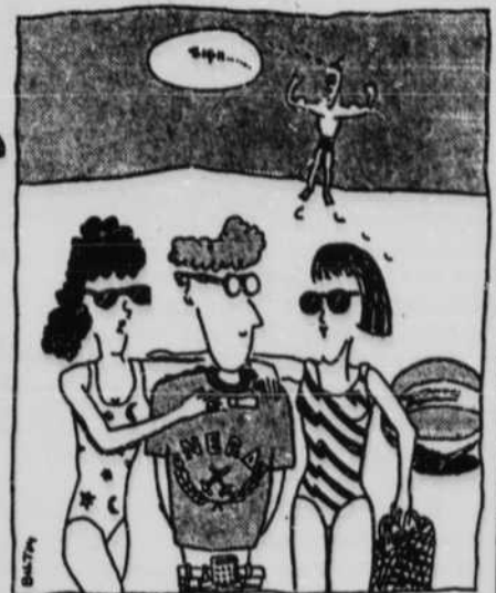
DEPENDENT OVER SHELDON'S LUCK WITH THE BABES, BRAD RECONSIDERS ATTENDING THE ZENITH OPEN HOUSE SALE...

Make Your Return To Campus A Happy One—Visit Your Zenith Data Systems Campus Open House.