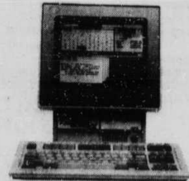
IBM® Personal System/2® Model 25

We think you'll find it's a perfect match.