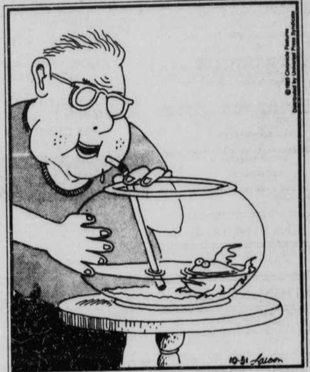
"Sol... you STILL won't talk, eh?"