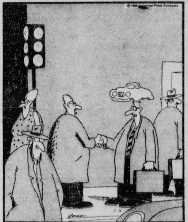
"Hey! Ernie Wagner! I haven't seen you in, what's it been - 20 years? And hey - you've still got that thing growin' outta your head that looks like a Buick!"