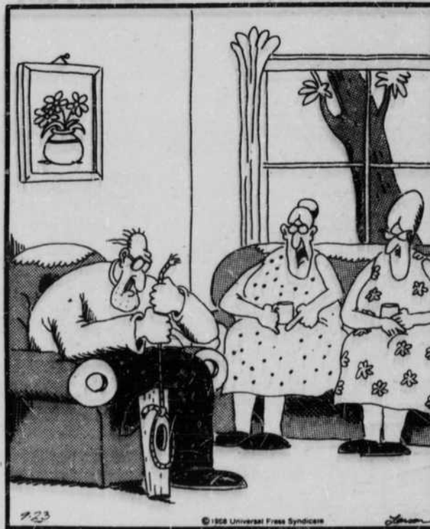
"Good heavens, Berniel We've got company! ... And you're never going to catch that stupid squirrel anyway!"