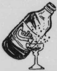
A bit of the bubbly