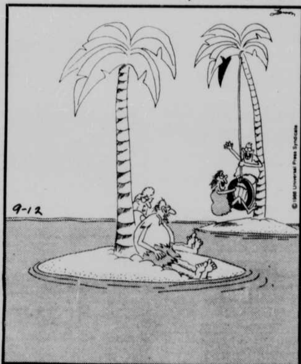
"Well, the Sullivans are out on their tire again."