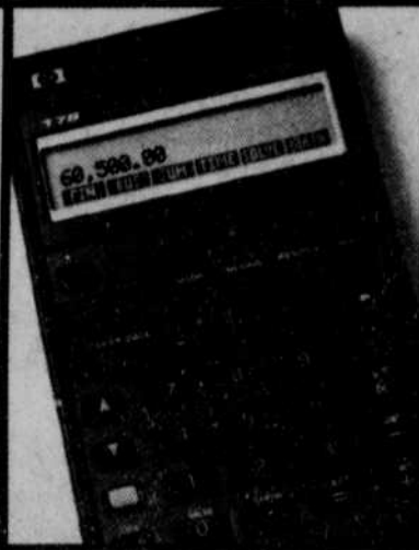
HP-17B BUSINESS CALCULATOR