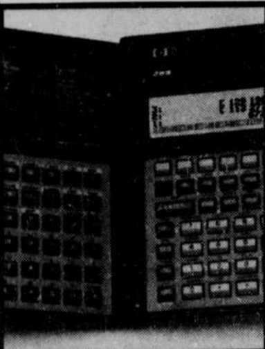
HP-28S SCIENTIFIC CALCULATOR