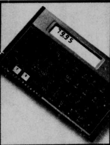
HP-12C FINANCIAL CALCULATOR