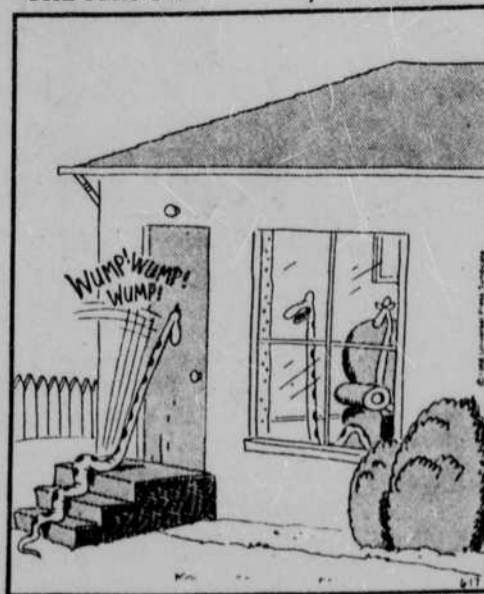
"I'm coming! I'm coming! ... Keep your skin on!"