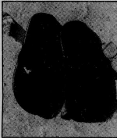
Retail value $15.00

Buy a pair of Men's or Women's Sperry Top-Siders® and get a free pair of Sperry thongs.*