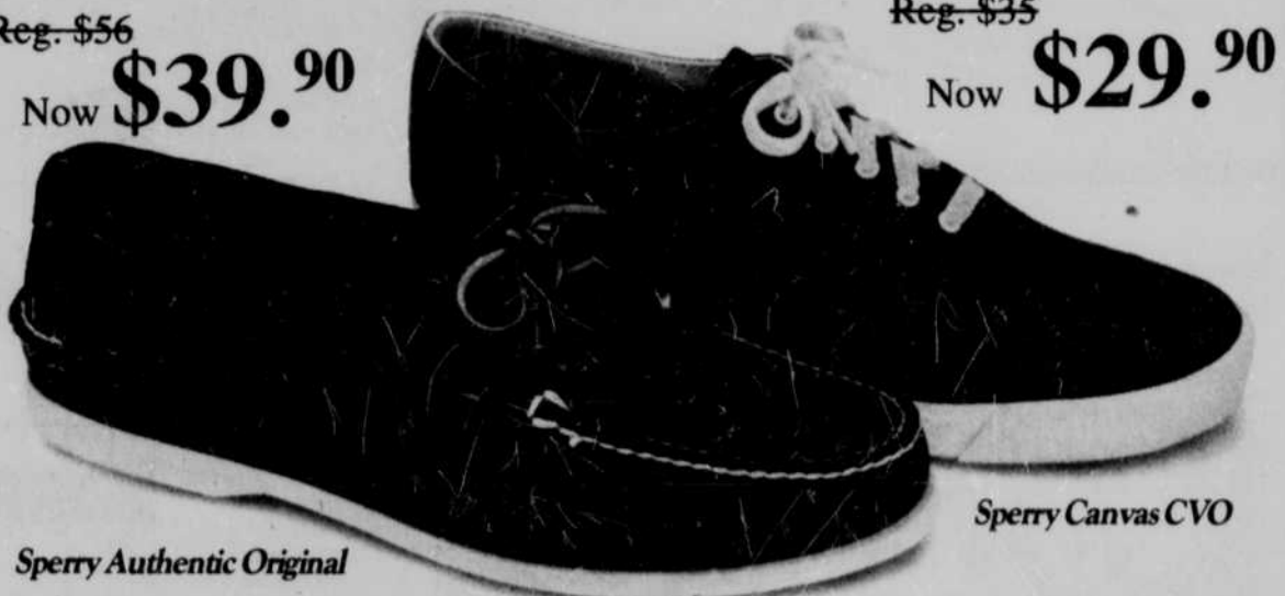
Sperry Authentic Original