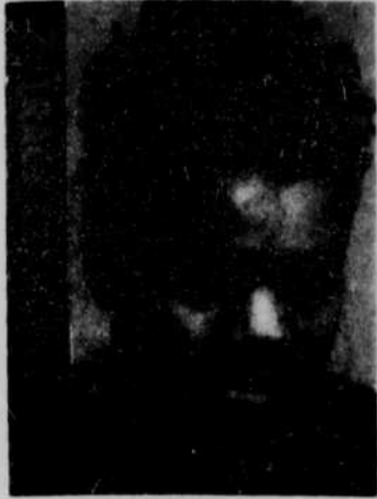
TRACY from Page 8

be positive for change in the future. Not only does she do all the vocals, but she writes her own words and music, and plays electric and acoustic guitars, as well as percussion, in her songs. This is very uncommon these days among all the Debbie Gibson/Tiffany-type wanna-be's available on today's airwaves. Therefore, Chapman makes provides a rare treat. The combination of her voice, which has been likened by some to that of Joan Armatrading and Joni Mitchell, and the way she addresses social concerns through her words and music, makes for an album well worth listening to if you are looking for quality music with a quality message.