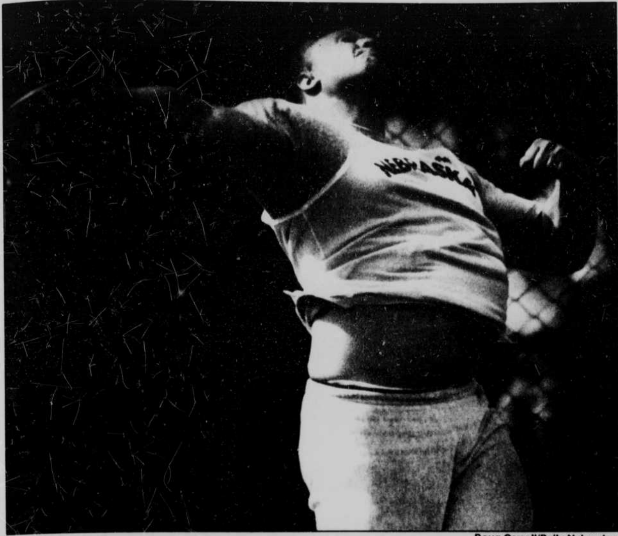
Doug Carroll/Daily Nebraskan