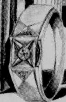
Men's Diamond Ring