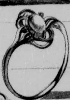
Opal and Diamond Ring