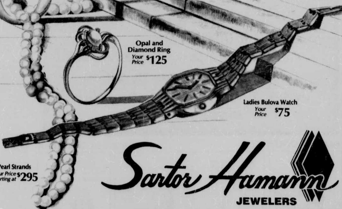
Ladies Bulova Watch