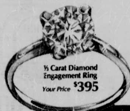
1/2 Carat Diamond Engagement Ring