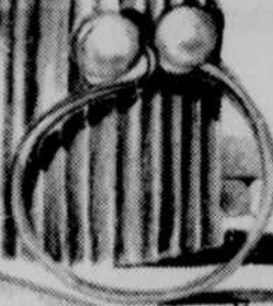
Double Pearl Ring