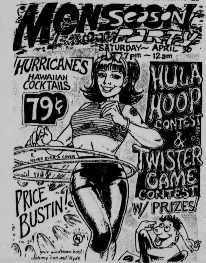
322 SOUTH 911! STREET, LINCOLN, NE 68508 · 476~8551