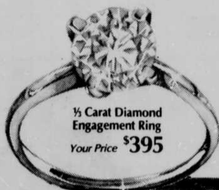
1/2 Carat Diamond Engagement Ring Your Price $395