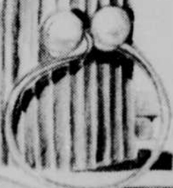
Double Pearl Ring