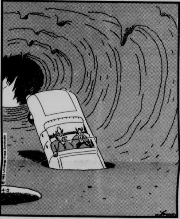
"You moron! From a hundred yards back I was screaming, 'Hell-hole! Hell-hole!'"