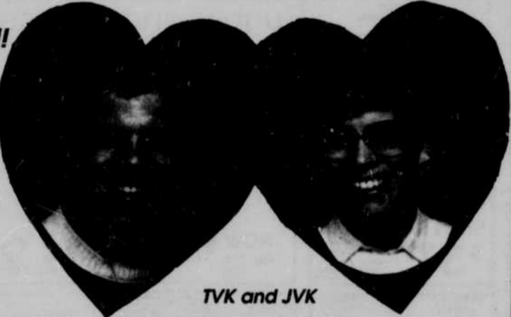
TVK and JVK