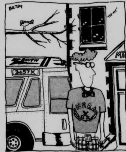
SUDDENLY, TIME STOOD STILL, BIRDS FELL SILENT, CO-EDS QUIVERED IN ANTICIPATION. SHELDON--THE ZENITH COMPUTER NERD--HAD STEPPED OFF THE BUS...

Submit material to the Daily Nebraskan, 34 Nebraska Union, 1400 R St., Lincoln, Neb. 68588-0448.