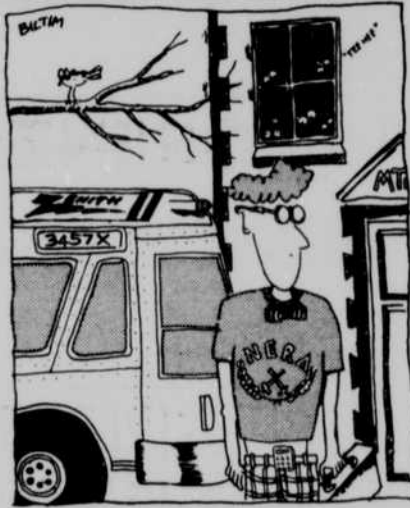
SUDDENLY, TIME STOOD STILL. BIRDS FELL SILENT. CO-EDS QUIVERED IN ANTICIPATION. SHELDON--THE ZENITH COMPUTER NERD--HAD STEPPED OFF THE BUS...