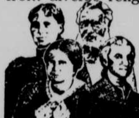
Clara Barton, Bell, Susan B. Anthony, Alexander Graham Bell, in center, Susan H. Anthony, suffragette, Joseph Priestley, a chemist, author, theologian, first to realize oxygen.

What do you have in common with Clara Barton, Alexander Graham Bell, Susan B. Anthony and Thomas Jefferson? All these people were independent thinkers who happened to share a common faith. A faith that today is practiced by 1000 congregations across the continent. A faith that doesn't separate religion from daily life; that provides a community which encourages freedom of thought and room to grow. A faith that welcomes people from diverse religious backgrounds. And offers a spiritual tradition of hope that celebrates our individuality.