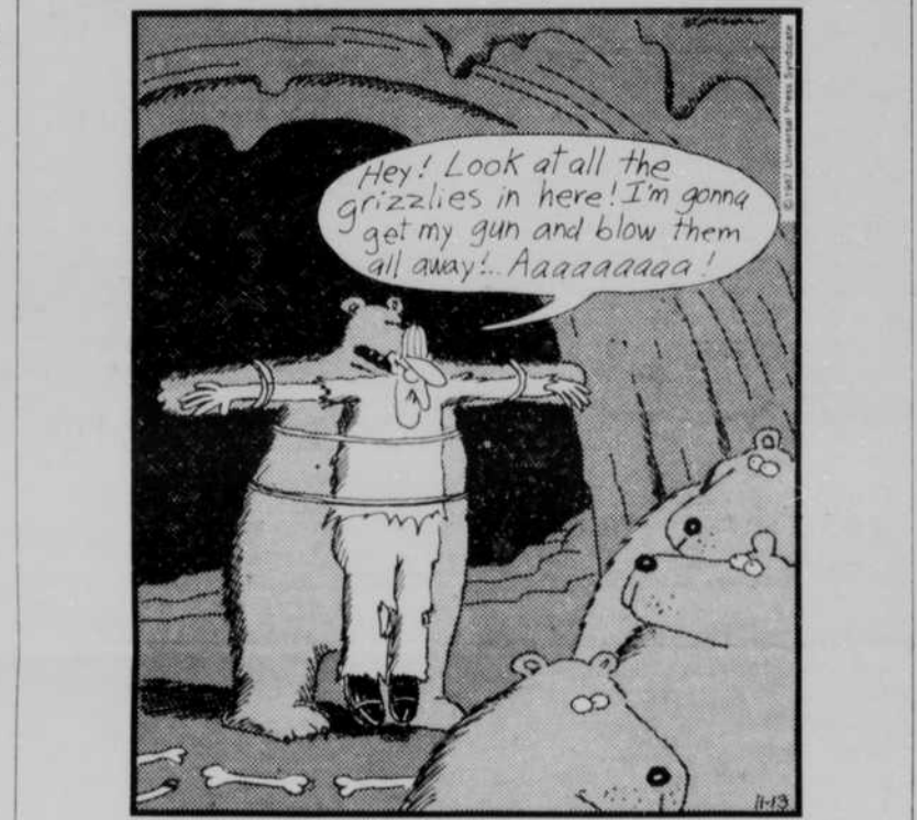
Bernie's sense of humor was seldom appreciated among the other bears.