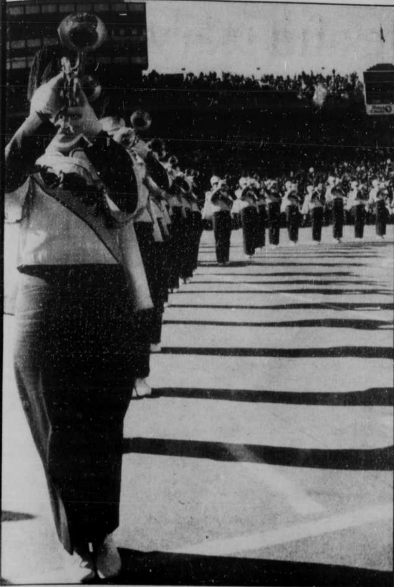
Husker marching band