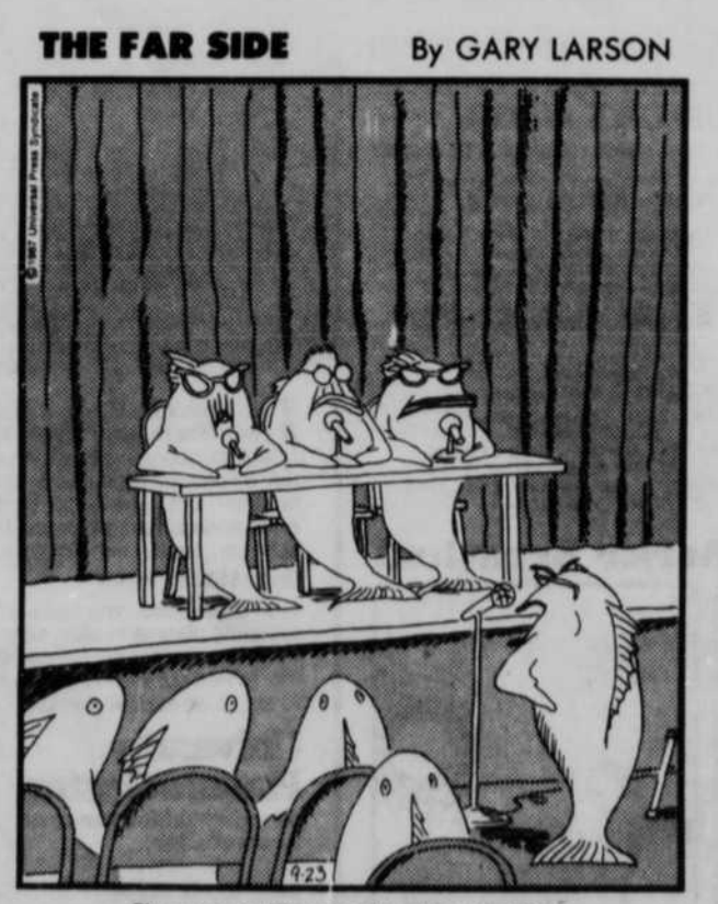
The committee to decide whether spawning should be taught in school.