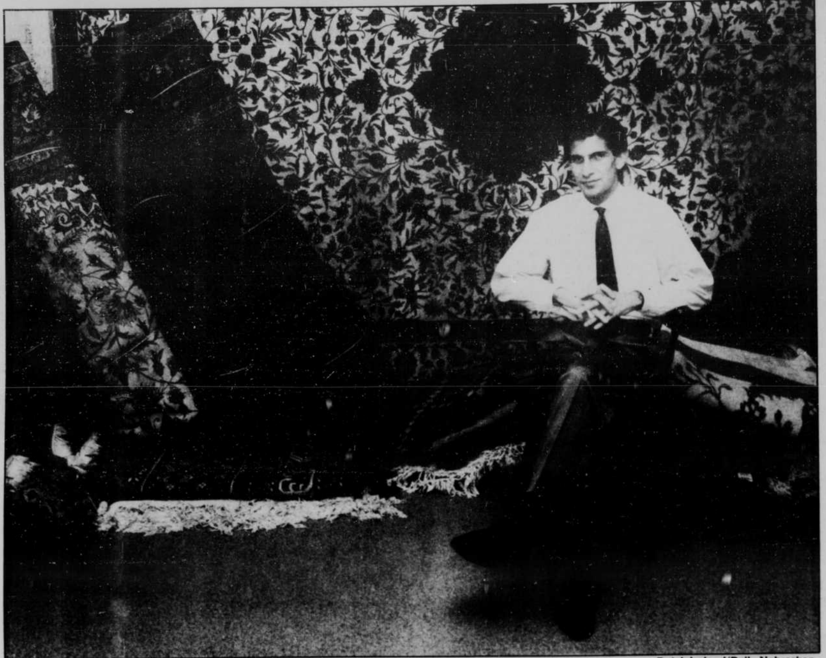
Butch Ireland/Daily Nebraskan

A rug under 20 years old still is considered new, while any over 50