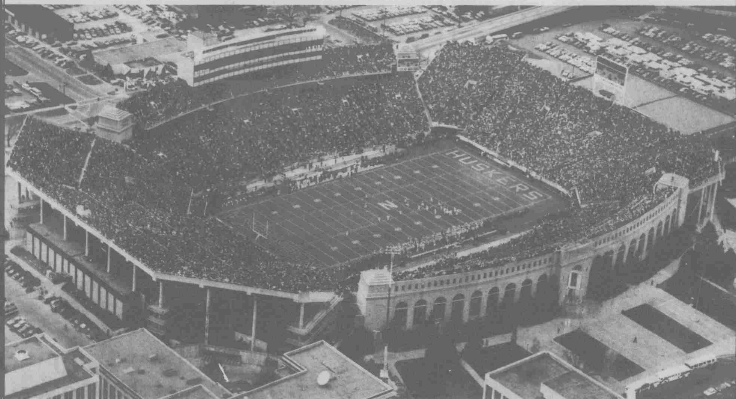
Reflections by Theo