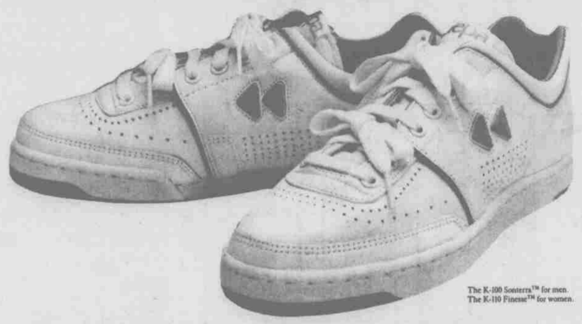
The K-100 Sosterra™ for men. The K-110 Finesse™ for women.

The second lace helps Kaepa athletic shoes perform under pressure better than any other shoe. A conventional shoe can't duplicate your foot's movements, because unlike your foot, it doesn't have moving parts. When your foot flexes, the shoe distorts, pinching down at the top of your foot and bulging out at the heel. The Kaepa upper is made like your foot, with two parts. Each part is secured by a separate lace. When your foot moves, the two parts move like a body joint, smoothly mimicking your foot's flexing action.