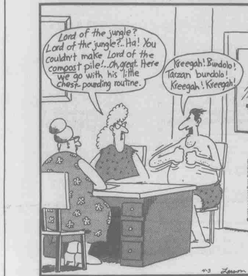
The Greystokes at marriage counseling