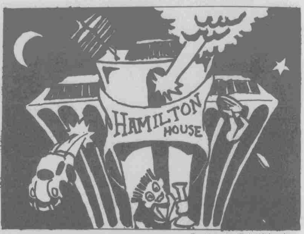
Tom Lauder/Daily Nebraskan

NEBRASKA STATE FAIRGROUNDS EXPO BUILDING (ACROSS FROM DEVANEY CENTER)