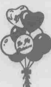
Bouquets of Balloons