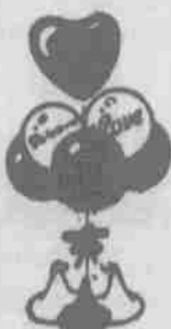
Balloons with Candy Anchor