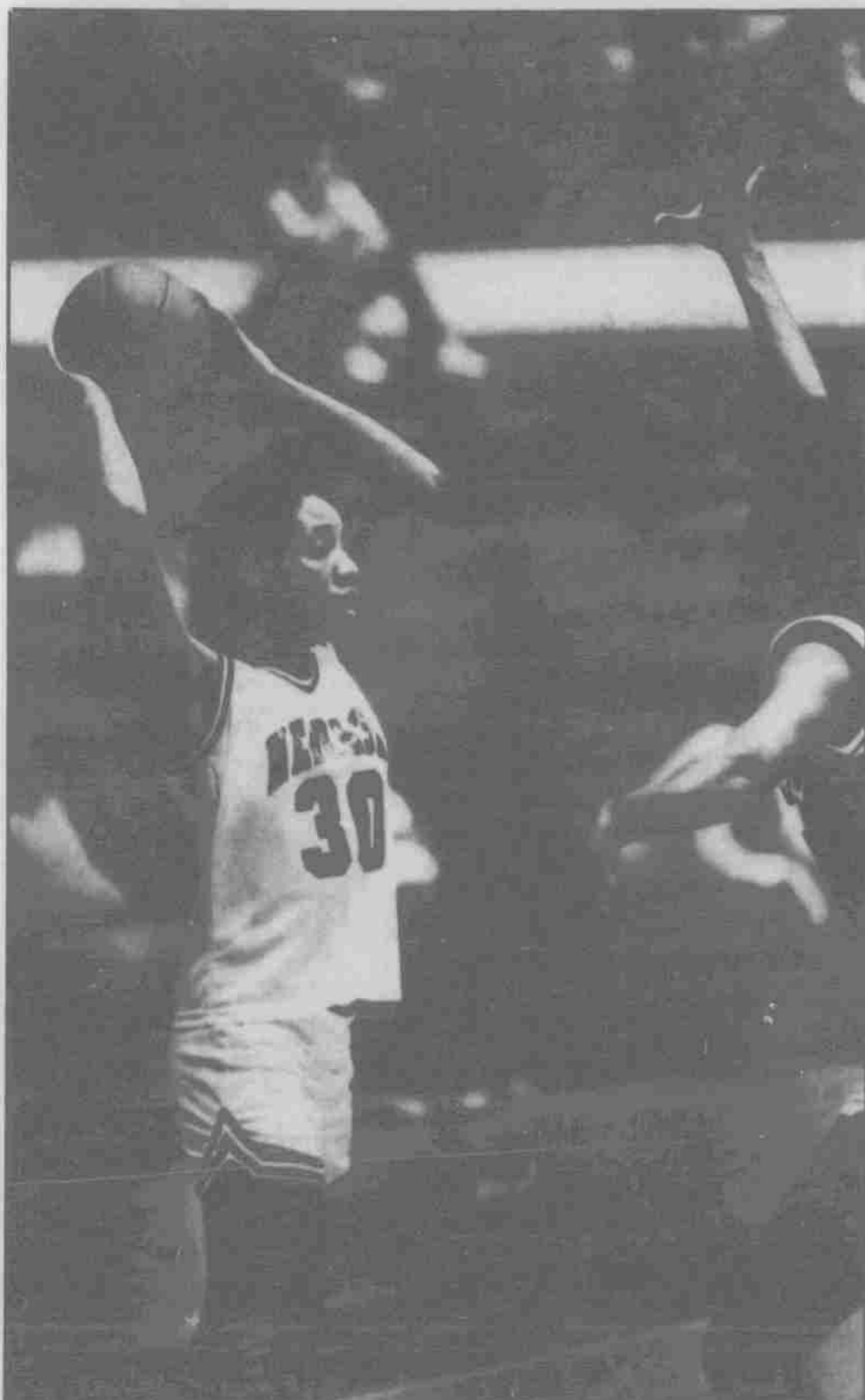
Doug Carroll/Daily Nebraskan