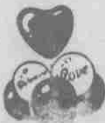
Balloons with Candy Anchors