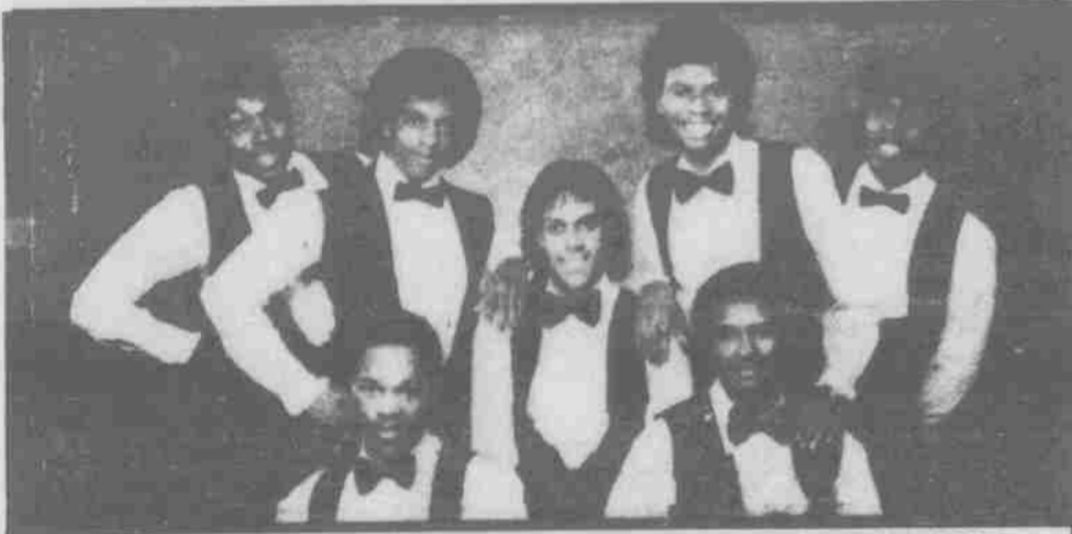
LINCOLN'S ONE-STOP NIGHTCLUB CENTER!