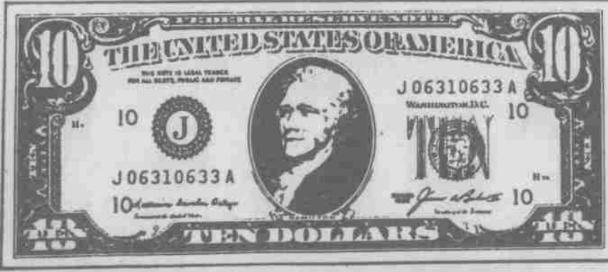
Lucky Friday offer ends September 27, 1986