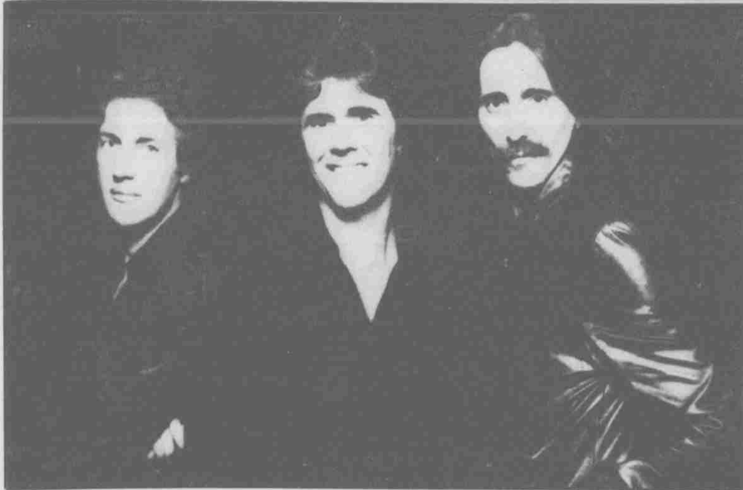
Three Dog Night