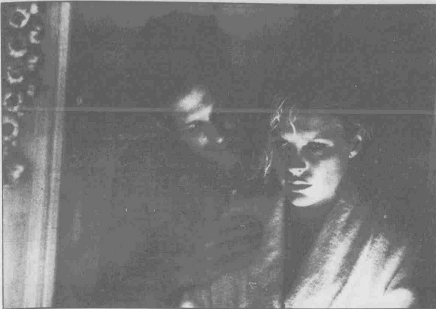
Rourke and Basinger.