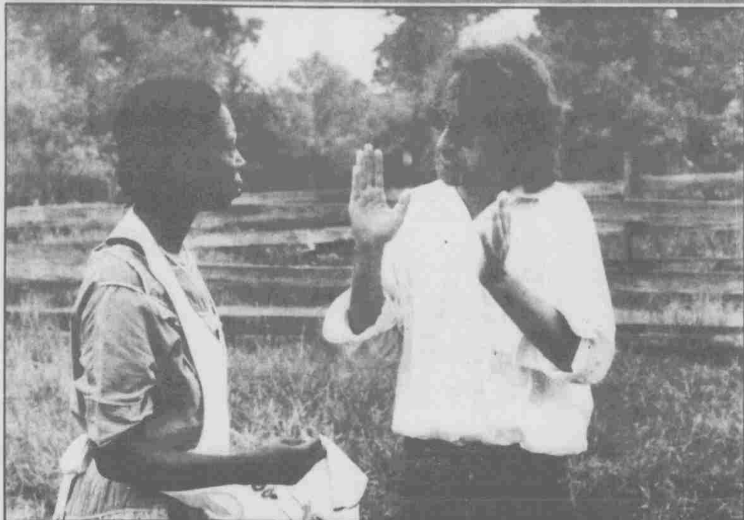
Goldberg, nominated for best actress, with Spielberg.