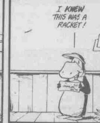
TABLE TENNIS EXHIBITION