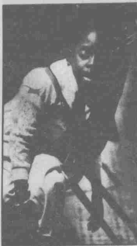
Dan Dulaney/Daily Nebraskan

The United Nations was established in 1945.