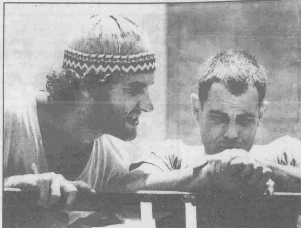
Randy Quaid (left) befriends Brad Davis and attempts to give him some advice in "Midnight Express," a tense drama based on the true story of Billy Hayes.