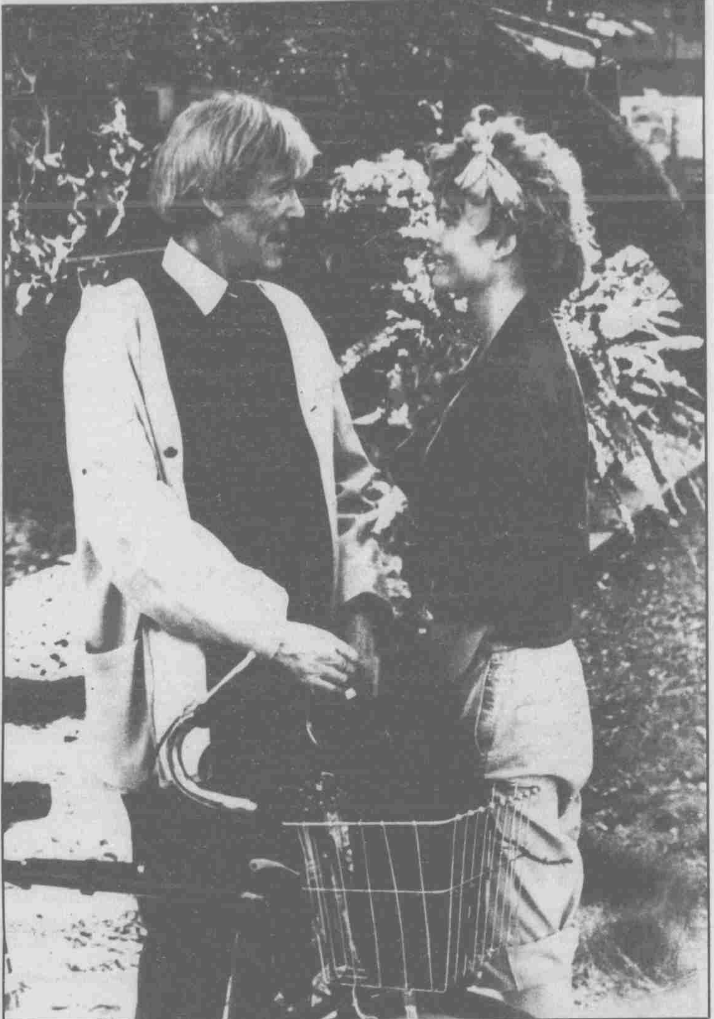
Meli (Mariel Hemingway) confronts Dr. Harry Wolper (Peter O'Toole) with the fact that she has fallen in love with him.