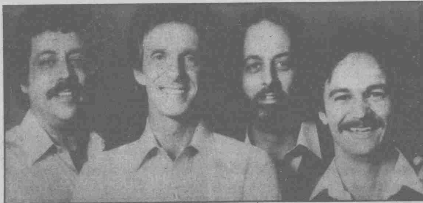
The Statler Brothers