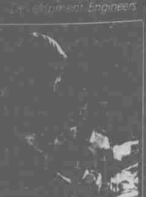
Aviation Great Fields