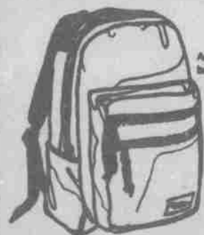
CHESAPEAKE An ideal size for all your books and extra gear.

No matter what condition it's in, your old bag is worth five dollars in cash toward any new Caribou pack or shoulder bag. Buy the best, buy it once. Caribou packs carry a lifetime warranty.