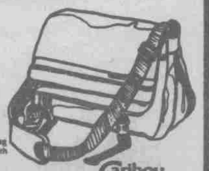
MACKINAW The expandable shoulder bag that doubles its capacity with the zip of a zipper.