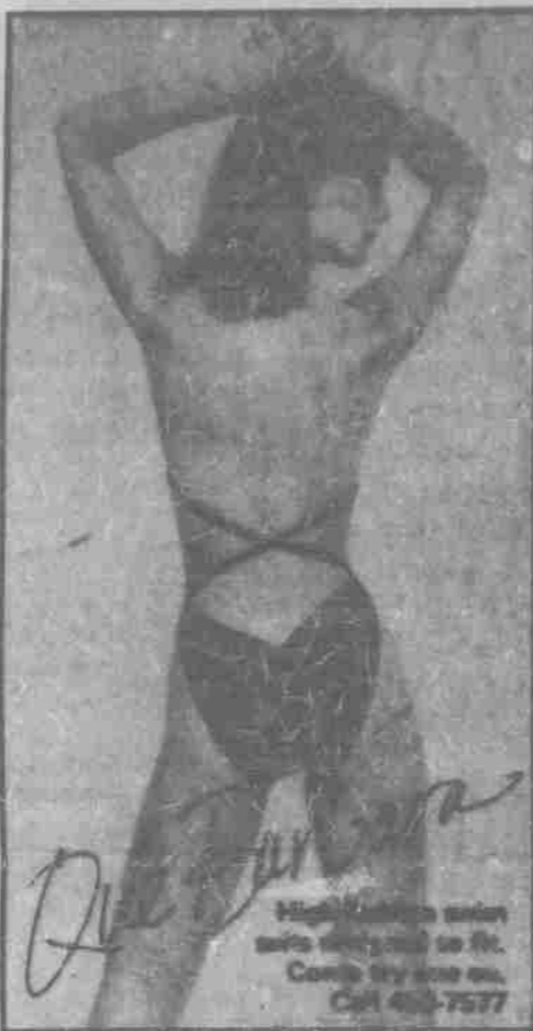
High fashion swim suits... Call 453-7577