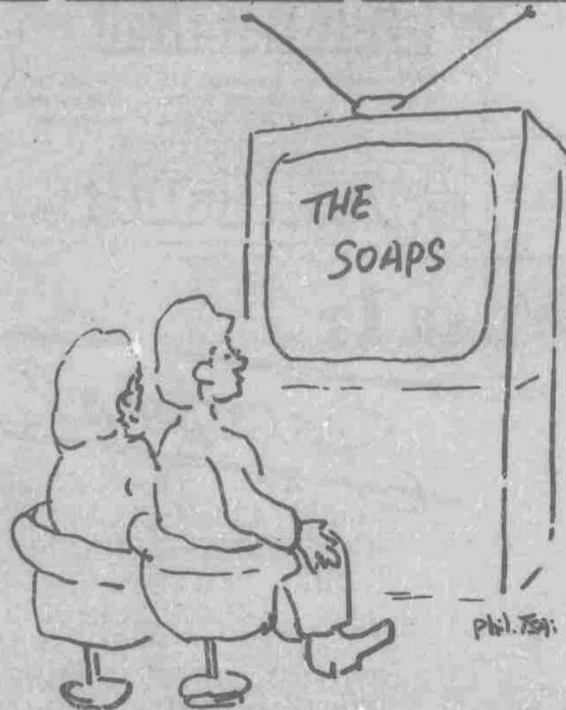
"DAYS OF OUR LIVES"