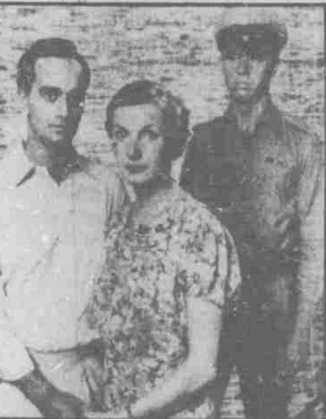
Three of the stars of "The Jewel in the Crown," which airs on NETV beginning tonight.

"The Jewel in the Crown," filmed extensively in India with a huge cast of British and Indian actors, is a sweeping dramatization of Paul Scott's four novels known collectively as "The Raj Quartet."