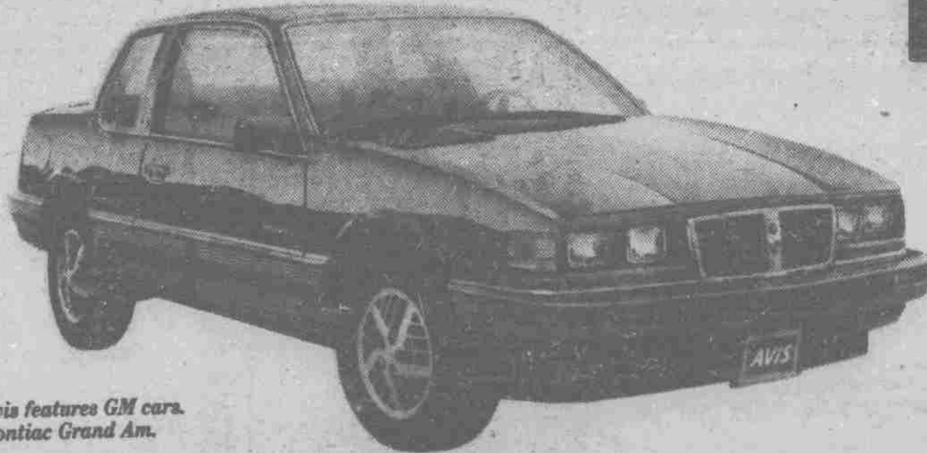
Avis features GM cars. Pontiac Grand Am.

Rate is nondiscountable; offer available at locations shown only. Cars and particular car groups are subject to availability and must be returned to renting city. Car must be returned no later than January 2, 1985 or higher rates may apply. Refueling service charges, taxes, optional CDW, PAI and PEP are not included. Renter must meet standard Avis age, driver and credit requirements.