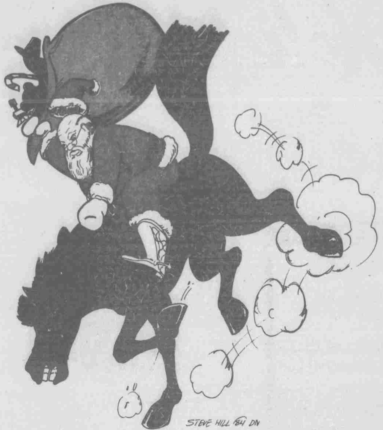
STEVE HILL '84 DN