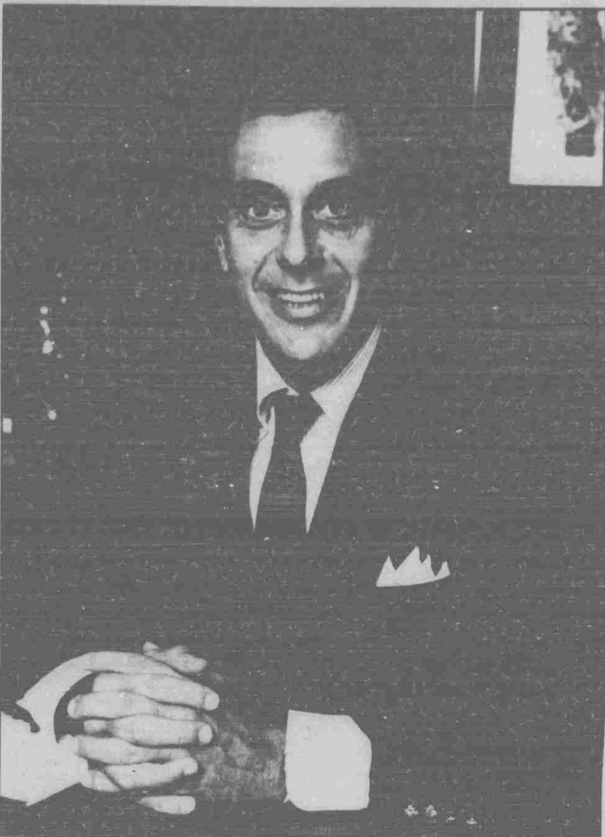
Kansas Coach Larry Brown enters his second year in Lawrence.

In addition to the tough conference games, Kansas will play Vanderbilt, Drake, and Louisiana Tech — all are ranked in the top 20.