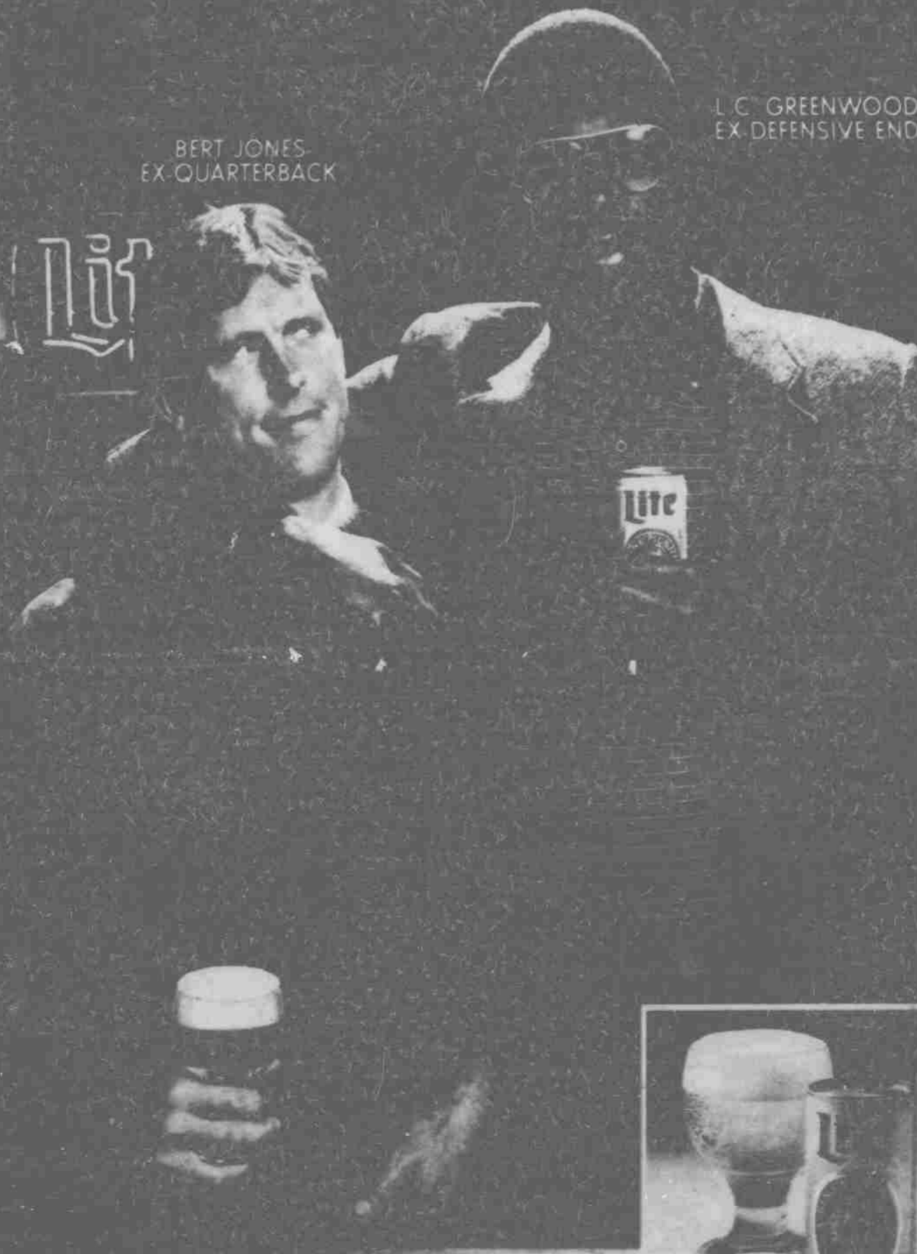
L.C. GREENWOOD EX-DEFENSIVE END

EVERYTHING YOU ALWAYS WANTED IN A BEER. AND LESS.